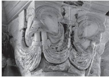
Morienvall apse chapels (a)