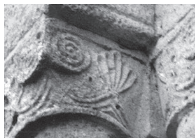
Retheuil tower (2)