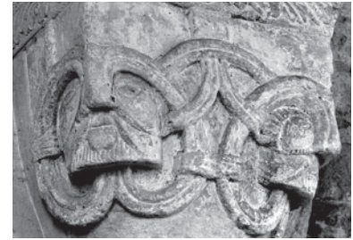
Morienvall apse clerestory (c)