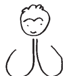
Old Duke template