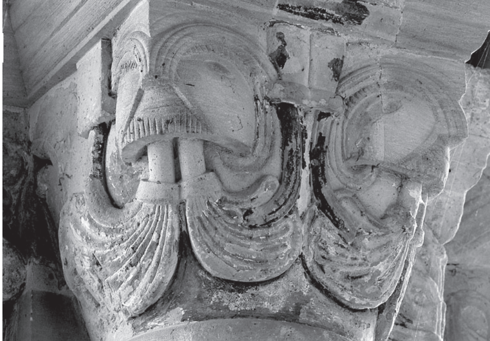
Morienval choir chapels