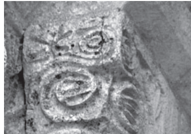
Oulchy-le-Château tower level 2