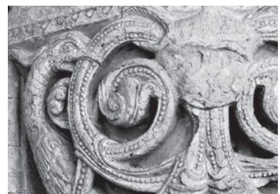
Bourges south portal by Félix