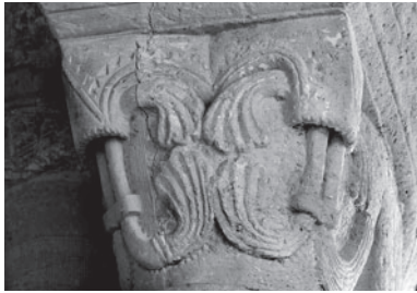
Morienvall apse chapels (a)