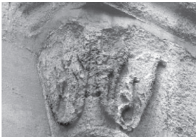
Auvers-sur-Oise north chapel window