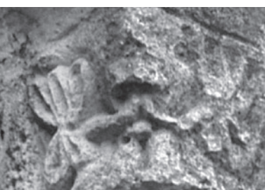
Morienvall west tower (3)