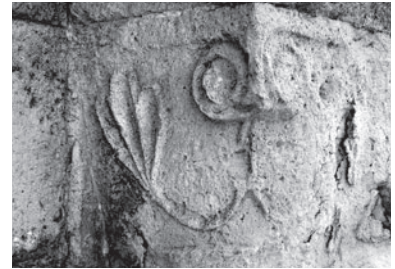
Bonneuil-en-Valois nave entry W.cR