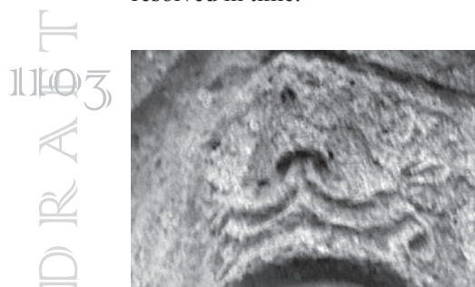
Morienvall west tower (3)