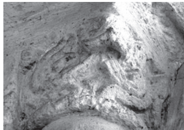
Maule apse window