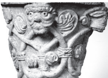
Nasher Museum, Duke University by The Duke

Confusion would be very easy at this point, for there are four masters who fit this description. One I have already described is the Duke Master whose tendrils emerge from the sides of the mouth and loop under the head to meet underneath [b1]. I have also described Félix whose tendrils flow the opposite way to each side where they scroll and loop in complex ways [b3]. The third I have only mentioned so far, is the Duchess whose arrangements are like Félix yet different in handling and artistry [b2]. Their templates are drawn schematically underneath.