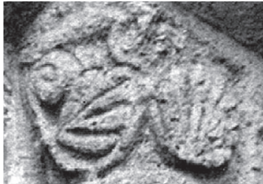
Oulchy-le-Château tower level 1