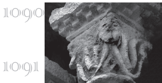
Saint-Vaast-de-Longmont tower (1)

At Montlevon [b+1] he was in the company of the Comet Master who carved some very complex capitals at the same time [b+2]. One wonders at their way of thinking when a skilled carver would allow a man with a much simpler approach to execute such a rudimentary design. In our view this would be downgrading the quality of the whole nave, but apparently not in theirs. They do not seem to have cared about the mis-matching in style and quality. Or did the fact that the Old Duke was an older man influence their choices?