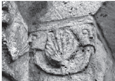
Oulchy-le-Château tower level 2