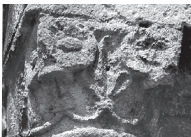
Retheuil tower (2)