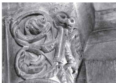
Poissy north aisle by The Duchess