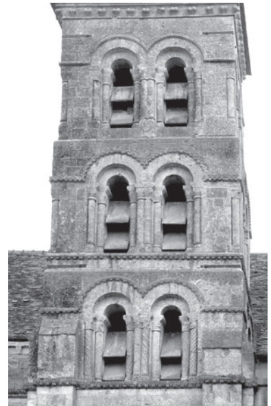
Oulchy-le-Château tower levels 1-3

In Phase 2 the vertical tendrils opened outwards before swinging in arcs to each side [b]. Some have leaves filling the lateral spaces that were carved as slabs with grooved gaps between the lobes. Carving a groove along the lobe was a simple approach and was a stage in developing more realistic foliage after Berneuil. In the tower of Oulchy-le-Château he worked on both the lower two levels. The impostes and the decoration on the shafts are different, though the square arching is the same on both lower floors [r].