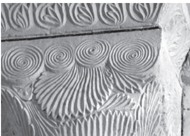
Montlevon nave by the Comet Master