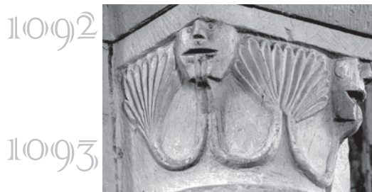
Montlevon nave by the Old Duke