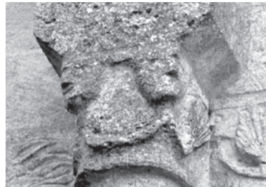
Oulchy-le-Château tower level 2