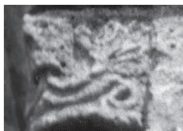
Morienvall west tower (3)